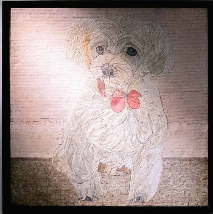
Small dog by [illegible] [illegible]